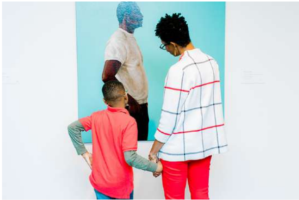
A student and his mother interact while admiring a painting by Barkley Hendricks at University of North Carolina's Ackland Art Museum.