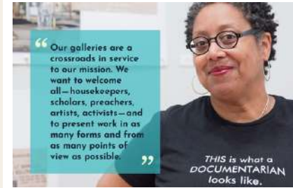
Courtney Reid-Eaton Center for Documentary Studies North Carolina

Through whose lens do we view the stories that shape our world view? How do we expand that point of view?