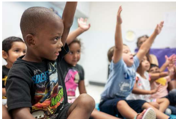
Children participate in a unique music therapy model that transforms the lives of people on the autism spectrum at Voices Together.