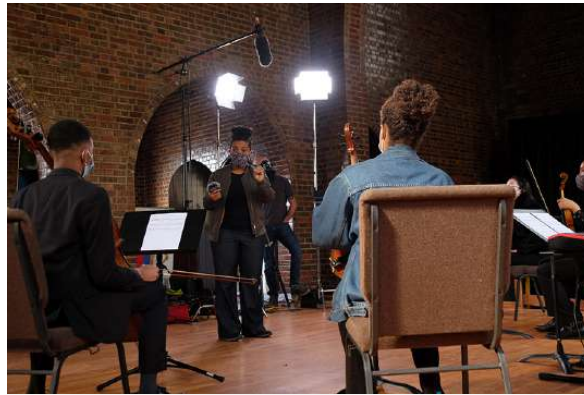
Young musicians, with no previous training, rehearse to perform through an innovative creative youth and development program at KidzNotes.