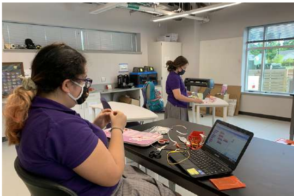
GLOW Academy Coding Workshops are hosted by the College Bound Team, replacing what would have been in-person club experiences during COVID-19.