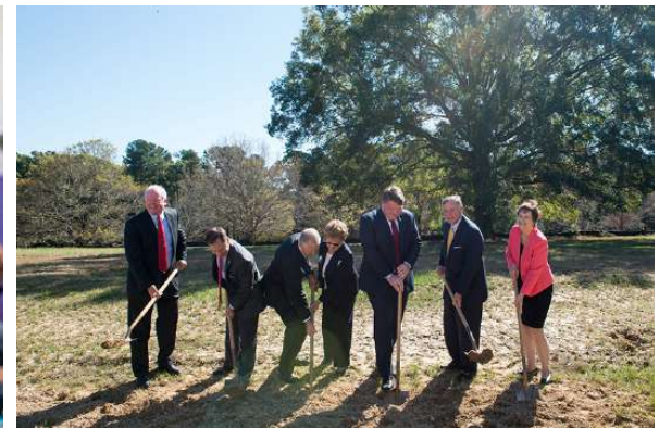
Groundbreaking of the Veterans' Life Center, the first facility of its kind, helping at-risk 21st-century military veterans reintegrate into civilian life.