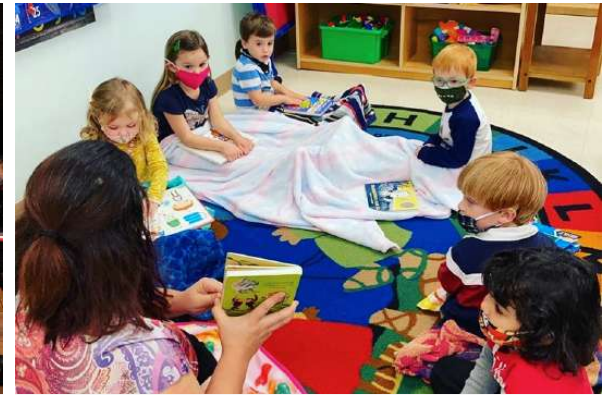
Memorial Presbyterian Church in St. Augustine, FL, created special provisions for children and church members to meet during the pandemic.