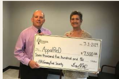
Gerry Roll Foundation for Appalachian Kentucky Kentucky