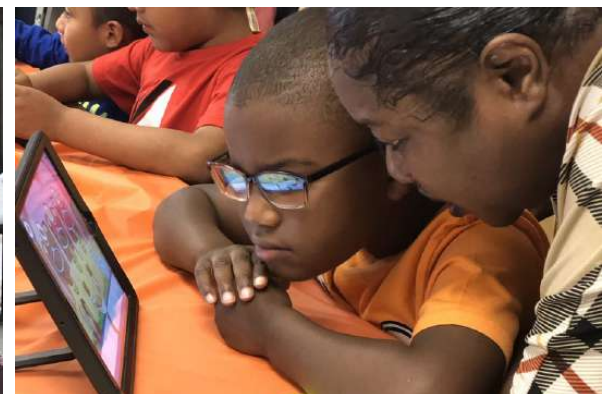
Children engage with the range of PBS early education resources delivered to them by their local Roothouse Ambassador at PBS North Carolina.