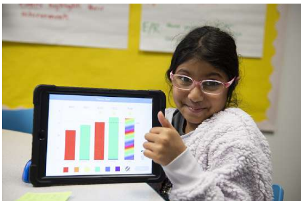
A student engages in high-tech platforms, though the Hill Learning System, a tool for literacy development at the Hill Center.