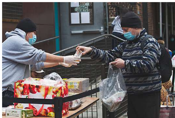
The New York Common Pantry distributes hot meals outside in New York City during the pandemic.